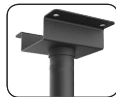
360° Rotation around the pole