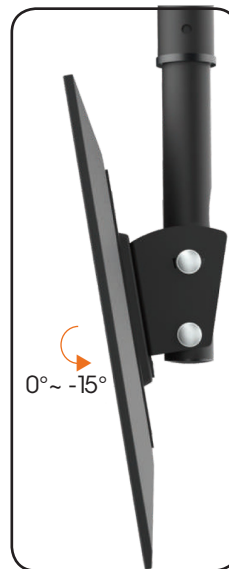
Tilt: 0° ~ -15°