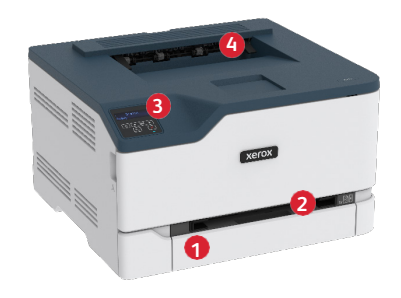
Xerox® C230 Colour Printer