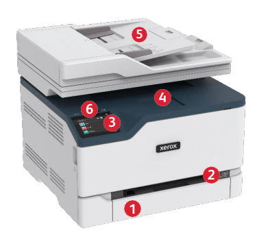
Xerox® C235 Colour Multifunction Printer